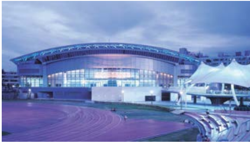
Competition Venue – Arena